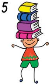
Build life skills