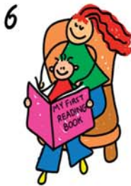
Meaningful involvement with positive adults