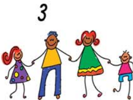
Safe nurturing care within the circle of family