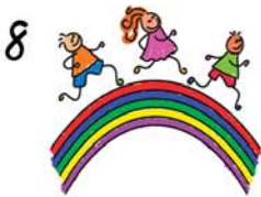
Absence of stress