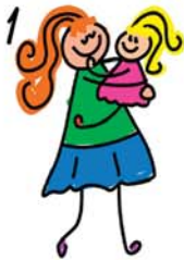
Positive healthy pregnancy