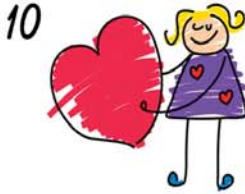
Strengthen the spirit