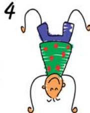
Plenty of play